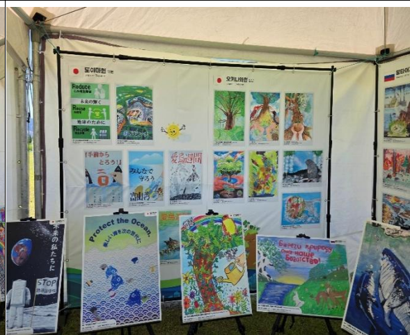
Booth (Front 2)