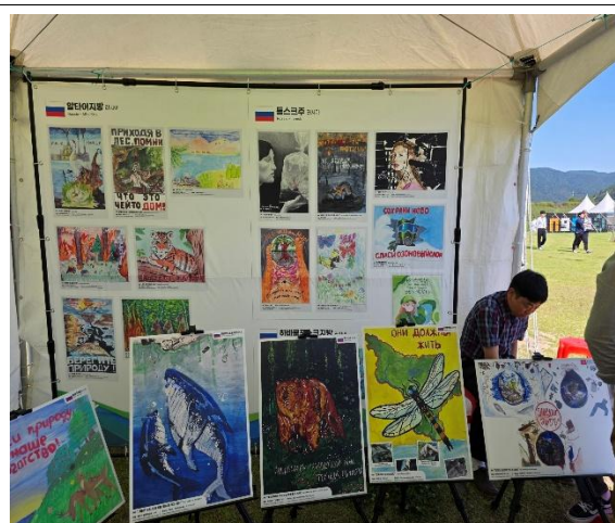
Booth (Right)- Altai, Khabarovsk, Tomsk