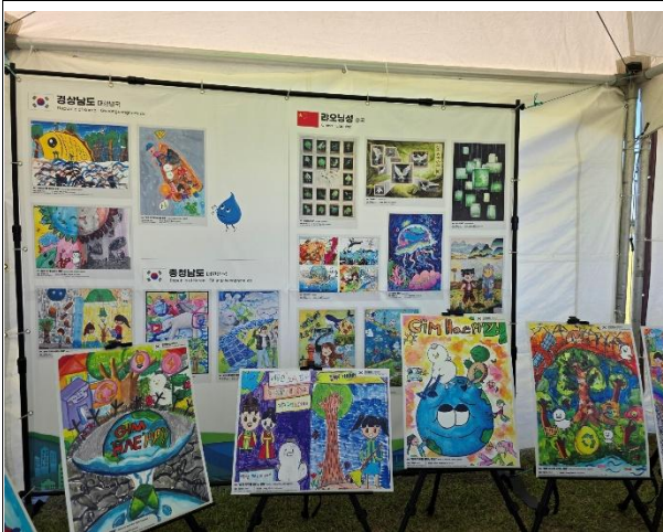
Booth (Front 1)