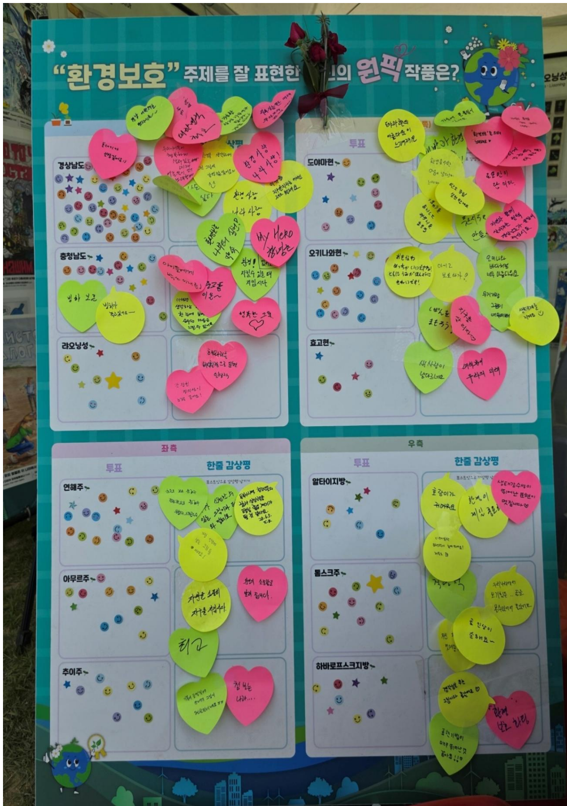
< Visitors' Choice Vote (Which poster best expresses the theme of environmental conservation?) and Visitors' Messages of Support >