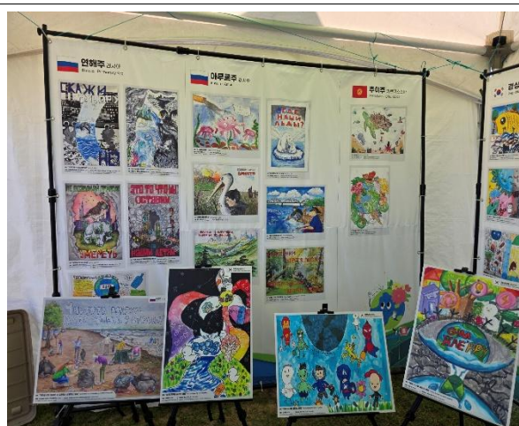
Booth (Left)- Primorsky, Amur, Chuy