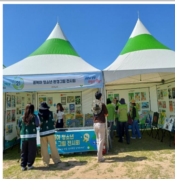
< Visitors viewing posters, 2 >