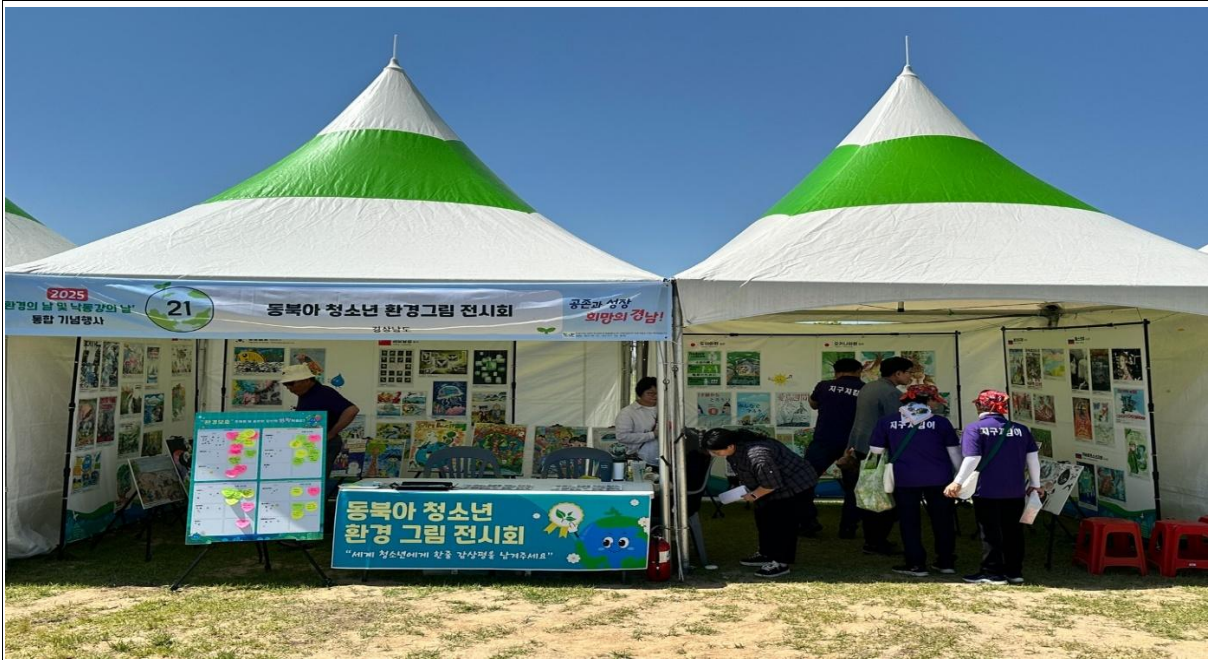
Front view of the entire booth